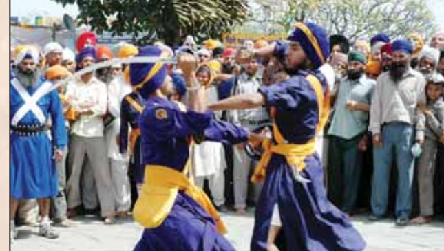
A display of Sikh Marchal Art (Gatka)