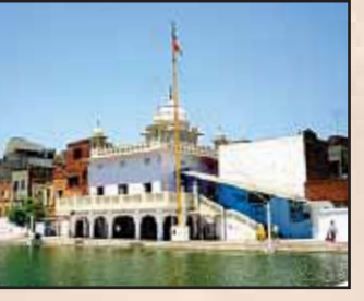
Gurdwara Saragarhi in the memory of 21 Sikh Soldiers, who fought with the Afgan invaders at North-West Frontier